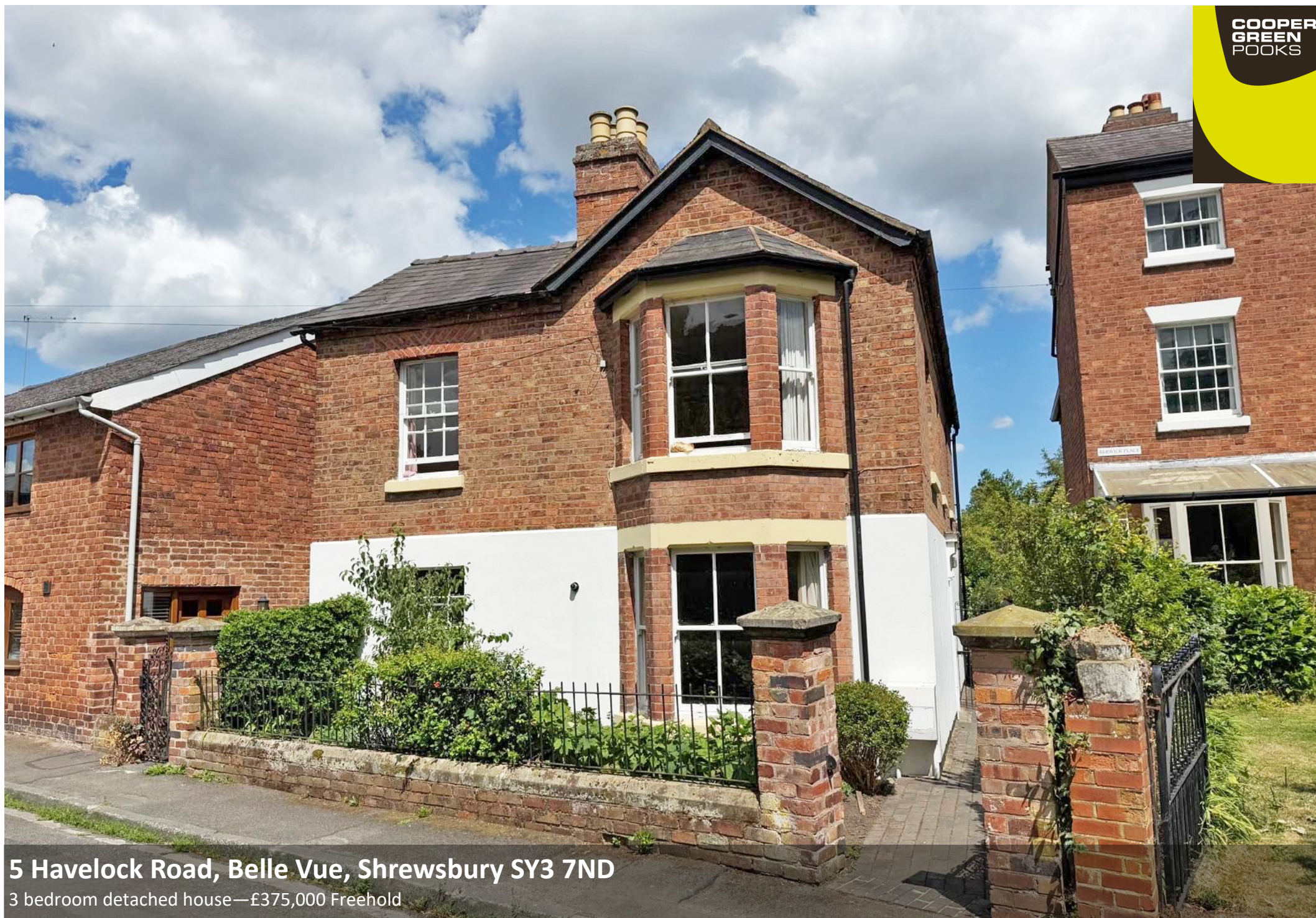
5 Havelock Road, Belle Vue, Shrewsbury SY3 7ND

3 bedroom detached house—£375,000 Freehold